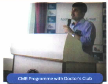
CME Programme with Doctor's Club