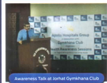
Awareness Talk at Jorhat Gymkhana Club