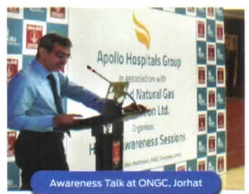
Awareness Talk at ONGC, Jorhat