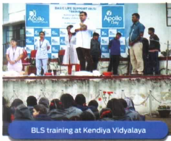
BLS training at Kendiya Vidyalaya