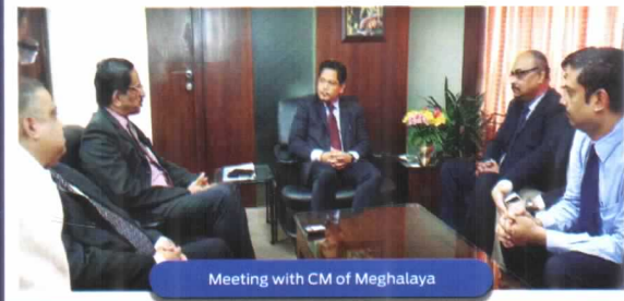
Meeting with CM of Meghalaya