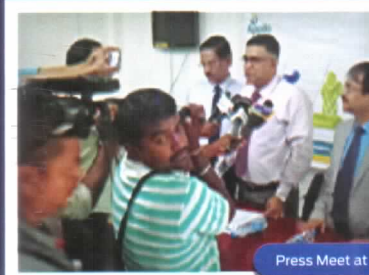
Press Meet at Jorhat