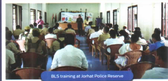
BLS training at Jorhat Police Reserve