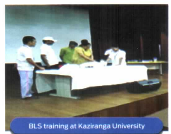
BLS training at Kaziranga University