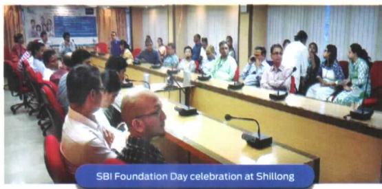
SBI Foundation Day celebration at Shillong