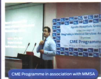
CME Programme in association with MMSA