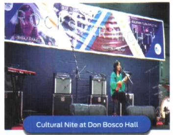
Cultural Nite at Don Bosco Hall